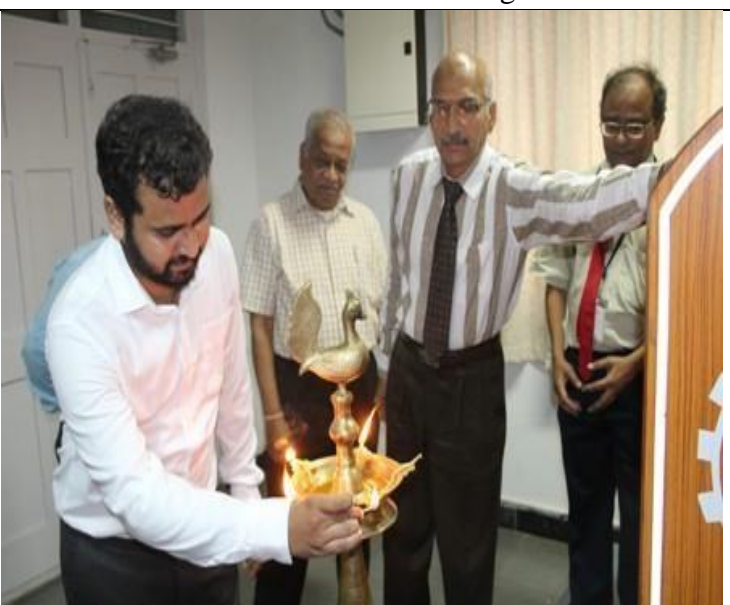
Resource Person Inaugurating the Event