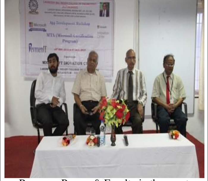
Resource Person & Faculty in the event